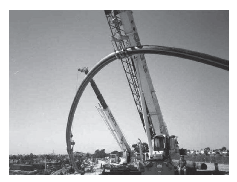
Figure 3 Butt Fused PE Pipe "Arched" for Insertion into Directional Drilling Installation