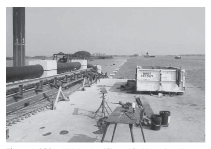
Figure 4 PE Pipe Weighted and Floated for Marine Installation