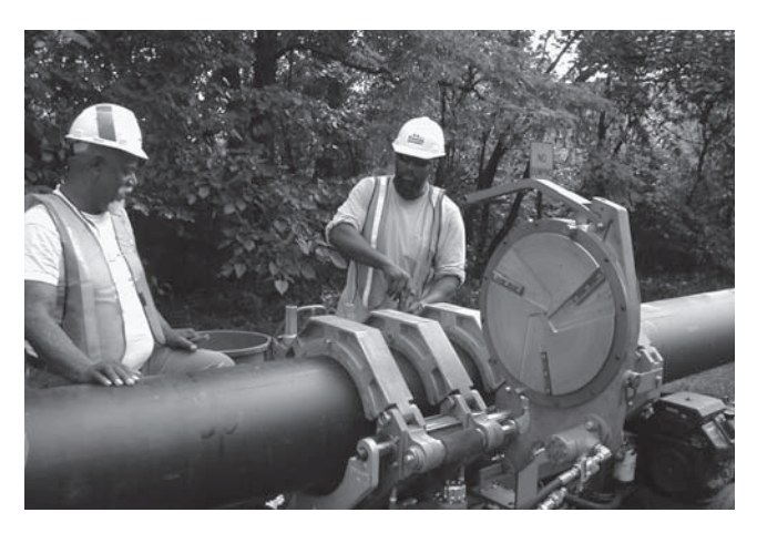
Figure I Joining Large Diameter PE Pipe with Butt Fusion

Since its discovery in 1933, PE has grown to become one of the world's most widely used and recognized thermoplastic materials.(1) The versatility of this unique plastic material is demonstrated by the diversity of its use and applications. The original application for PE was as a substitute for rubber in electrical insulation during World War II. PE has since become one of the world's most widely utilized thermoplastics. Today's modern PE resins are highly engineered for much more rigorous applications such as pressure-rated gas and water pipe, landfill membranes, automotive fuel tanks and other demanding applications.